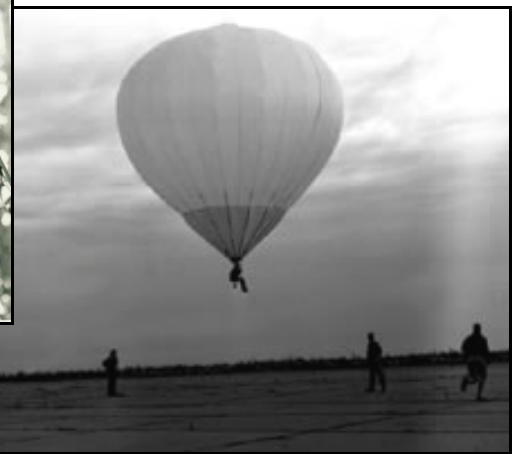
First flight of the modern hot-air balloon October 22, 1960

An Open House Honoring PAUL E. (ED) YOST FATHER OF THE MODERN HOT-AIR BALLOON