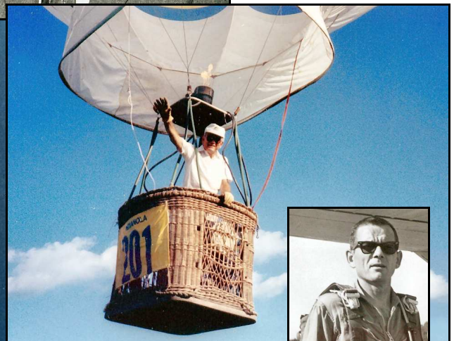
25 th Anniversary Flight 1990